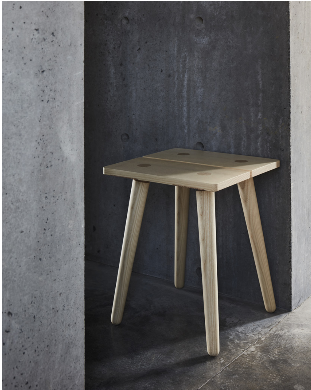
CHALET STOOL natural European ash

Stabelle seating has been at the heart of homes, chalets and taverns in the alpine region for centuries.