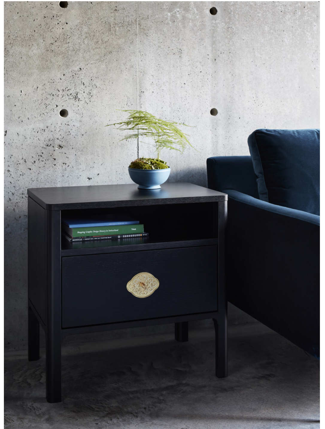
APPENZELLER SIDE TABLE ebonized European ash