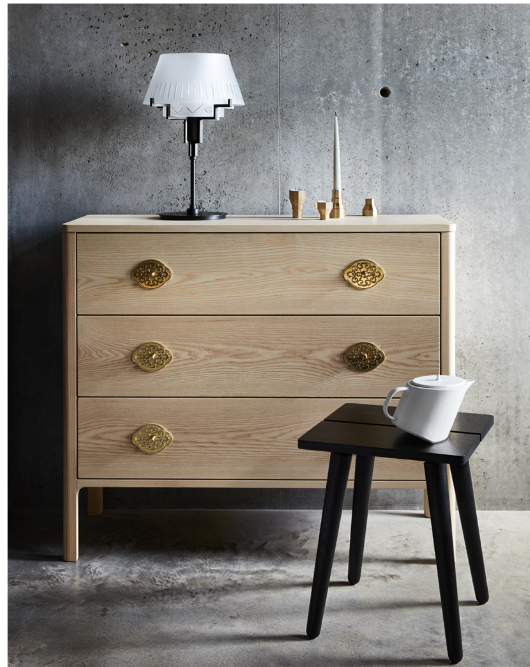
ALPINE COLLECTION Faceted Candle Holders, Appenzeller Dresser, Limen Teapot and Chalet Stool