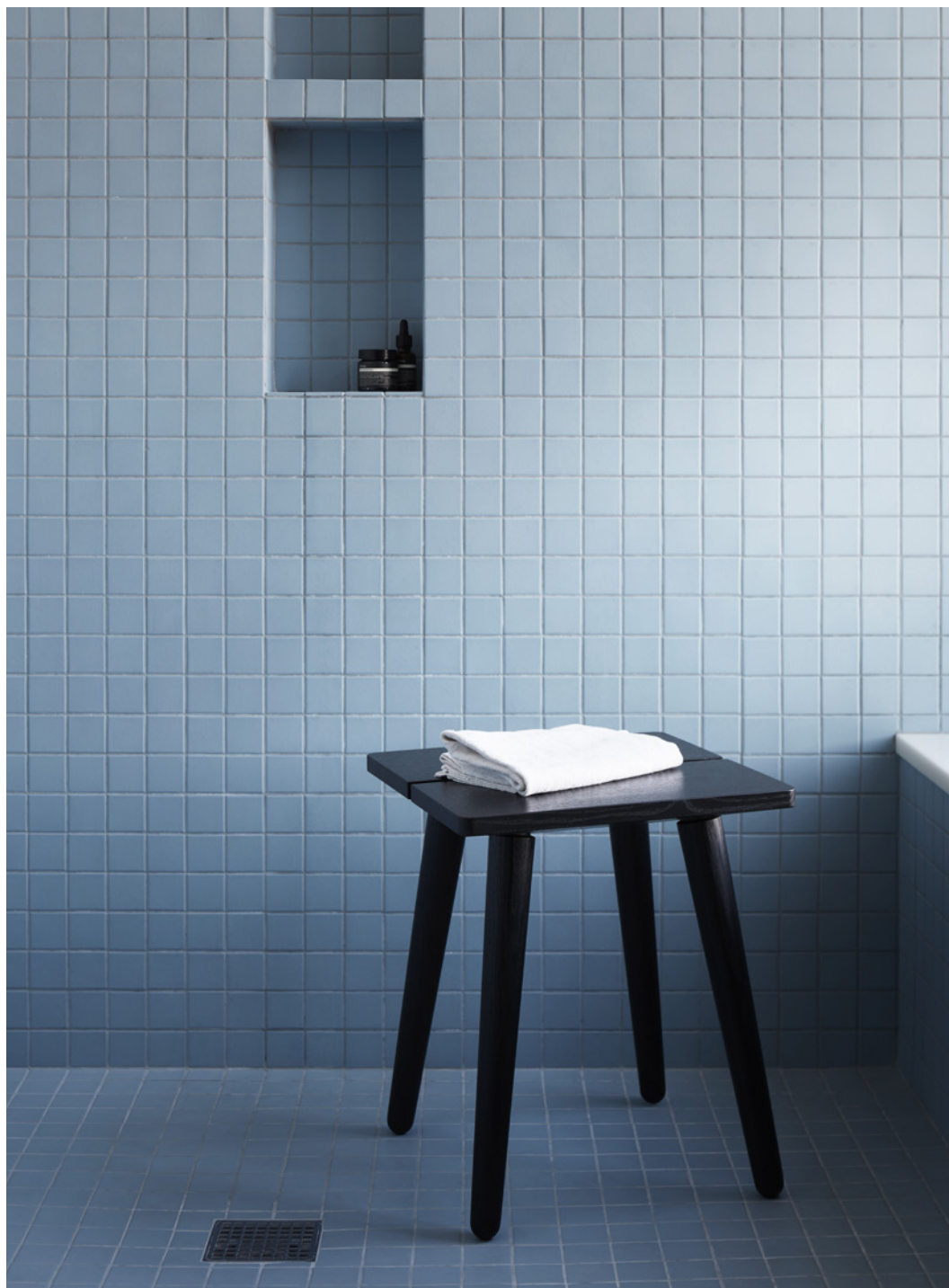
CHALET STOOL ebonized European ash

Made from solid European ash, the Chalet Stool's inherent simplicity pays homage to its longer predecessor —our Chalet Bench.