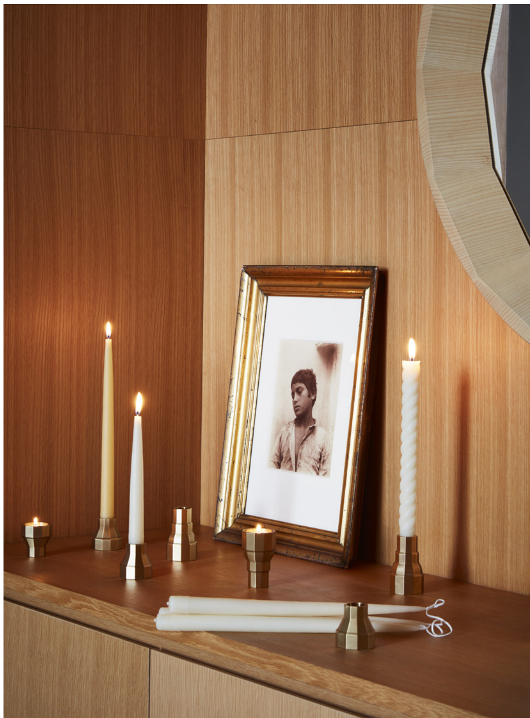
FACETED CANDLE HOLDER solid brass

Double up and spread the light with these reversible brass candle holders, inspired by the forms of Fahreimers—traditional Alpine milking pails from Appenzell.