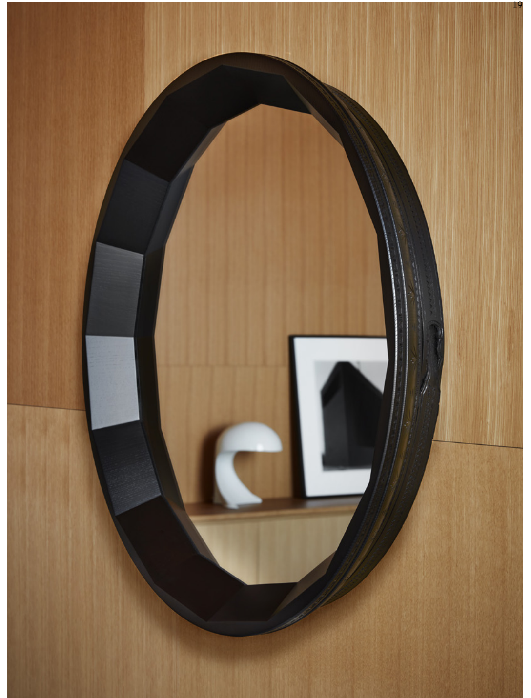
COOPERAGE WALL MIRROR ebonized European ash