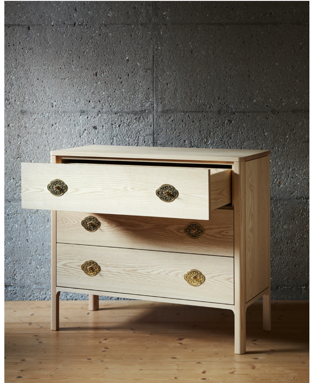
APPENZELLER DRESSER natural European ash