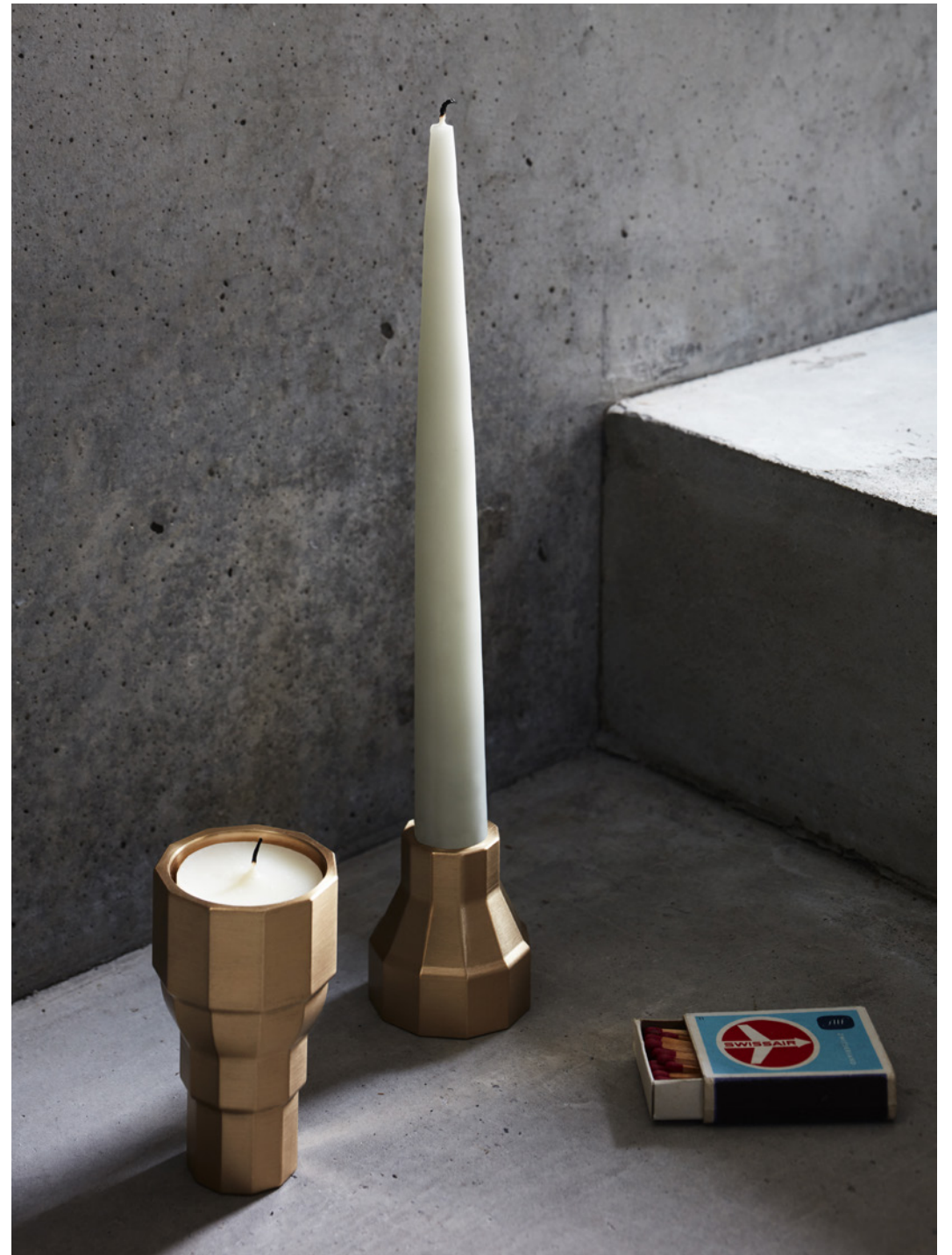
FACETED CANDLE HOLDER solid brass

These candle holders can be used in two ways: the narrow end can fit a long taper candle, or flip it to place a tealight on the wider end. Made from solid machined brass, these holders come in a set of varying heights—allowing you to layer your light at will.