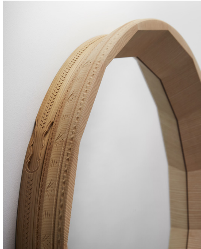
The round exterior is held together by a wooden "belt"—individually carved with heritage Swiss patterns through the craft of Schnitzerei.