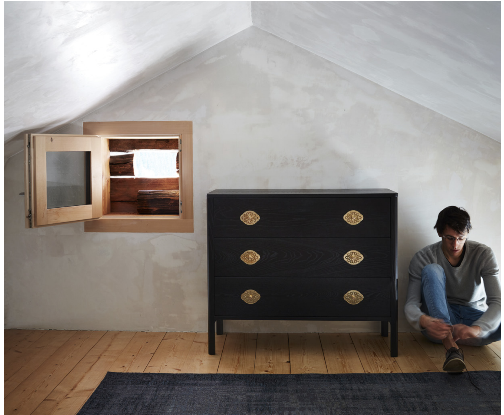
APPENZELLER DRESSER ebonized European ash

Each dresser is thoughtfully produced for functional living and lasting beauty. The longevity of our furniture in itself means that it is better for the environment—using only the best materials to ensure your piece can live for generations to come.