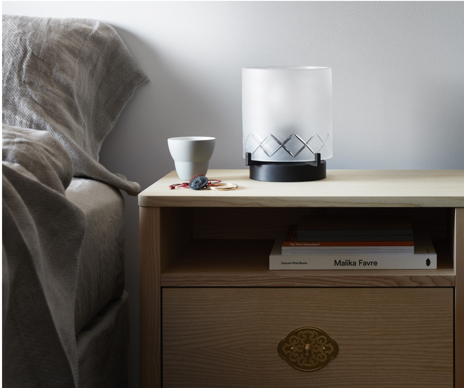
APPENZELLER SIDE TABLE natural European ash

This side table calls upon the traditions of Swiss Alpine joinery—serving streamlined silhouettes to the living and bedroom. A brass pull, ornamented through metal stamping, adorns the drawer.